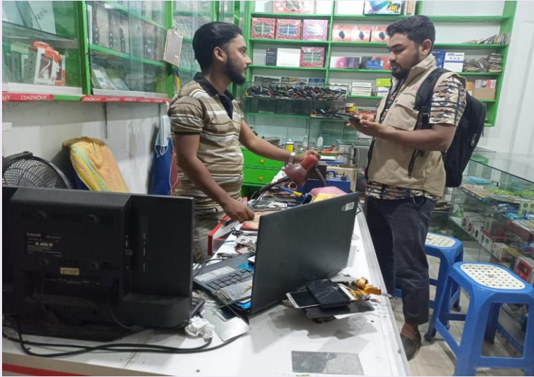
Selected Mobile Servicing Center for the Beneficiaries