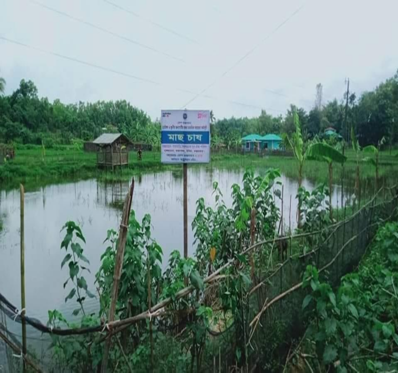
East Digholipara Oikka Parishad supported with Fish Cultivation