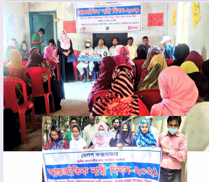
International Women's Day 2021