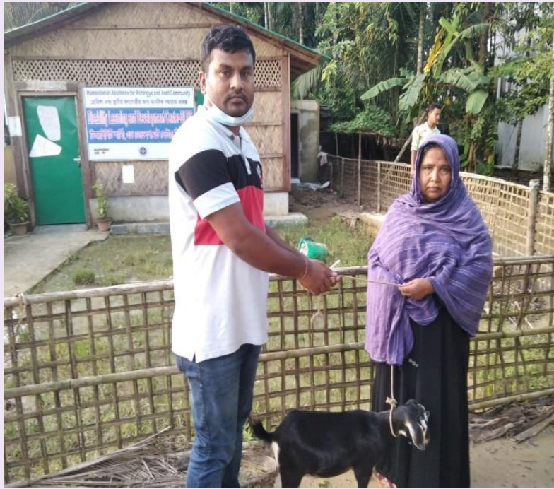
Woman with Disability Supported with Goat