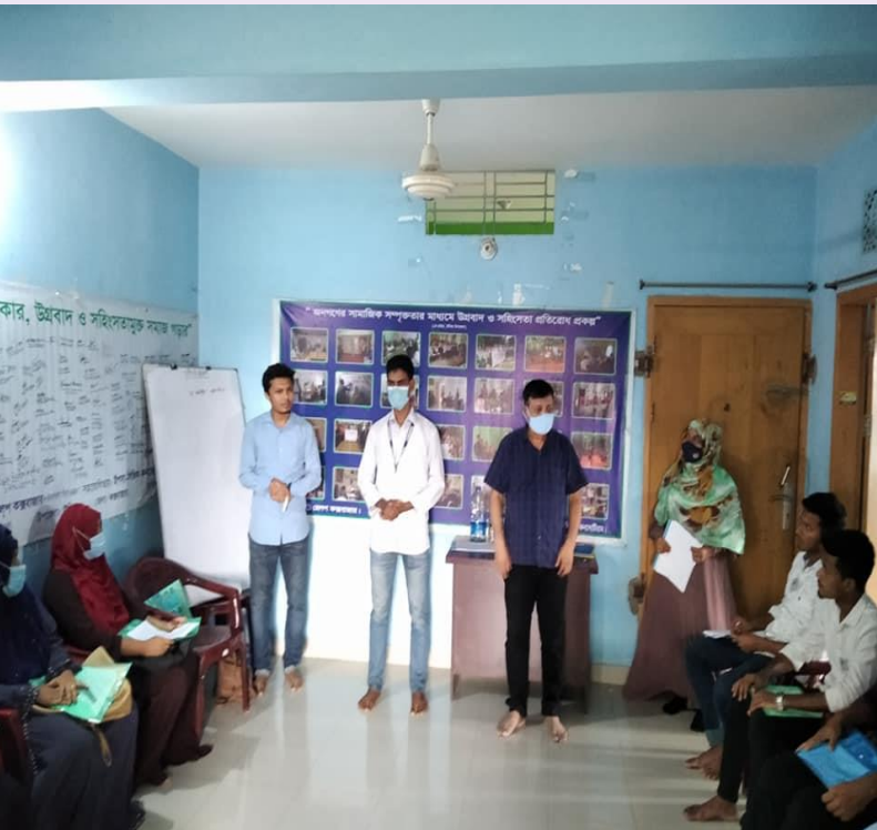
2 Days TOT Refresher on Life skill to Fatekharkol Youth Forum Members under Ramu Upazila