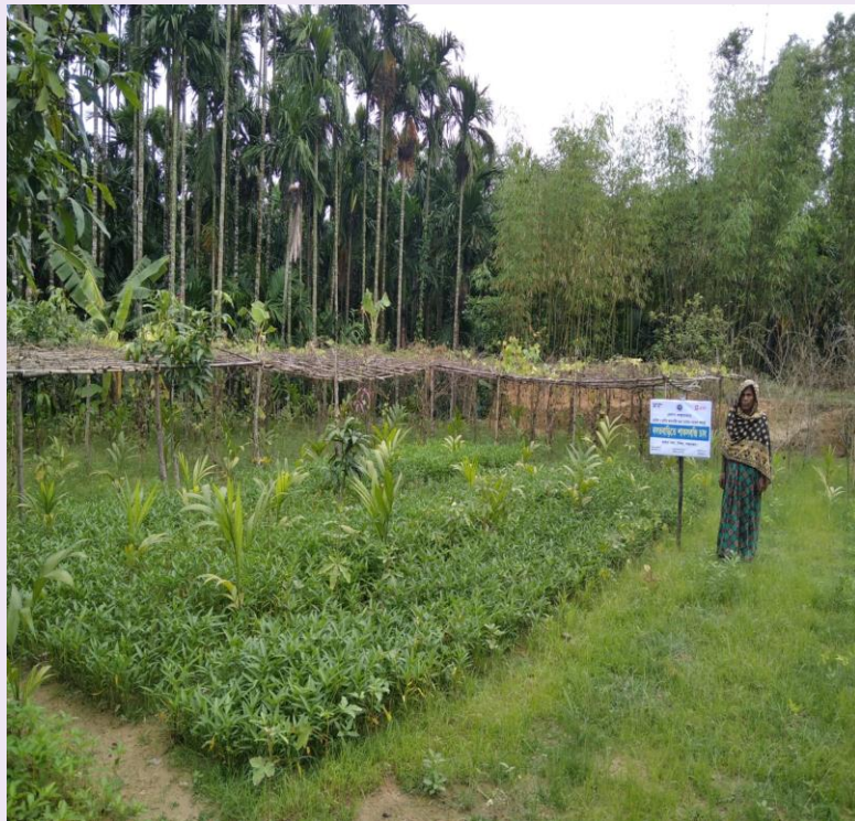
Poor woman Supported with Model Vegetable Gardening