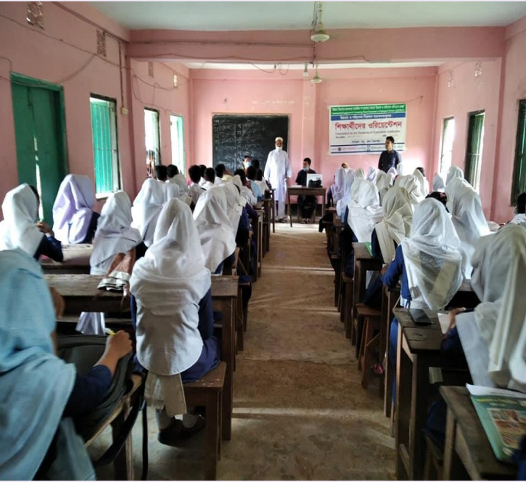
LSE session with the Student of Garjonia high School under Ramu Upazila