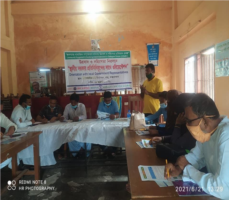
Orientation to the Members of Kaccopia Union Parisha under Ramu Upazila