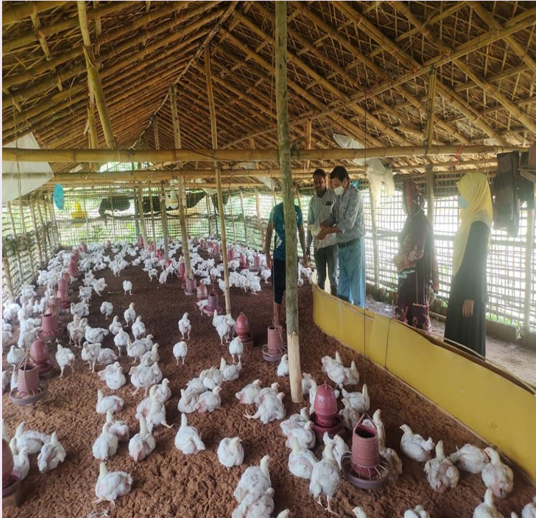
Jummapara sporting club supported with Poultry Farm