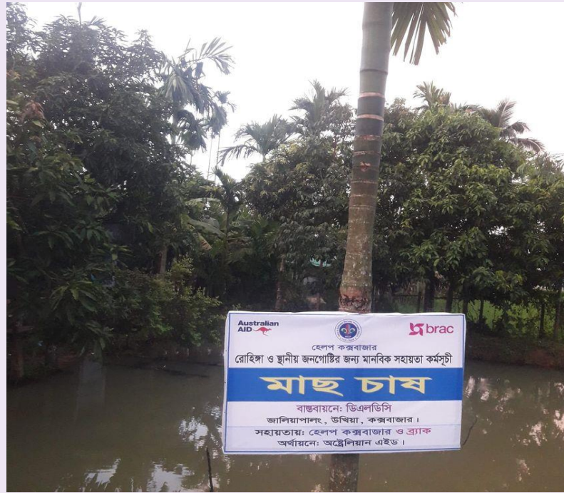
Disability learning & development Center supported Fish cultivation