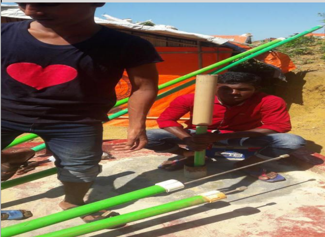
Tube well repairing work with providing Materials