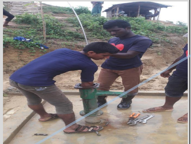
Tube well repairing work