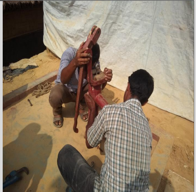
Tube well Repairing works