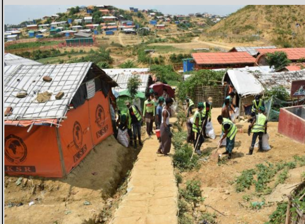
Waste Segregation & Transportation Process.